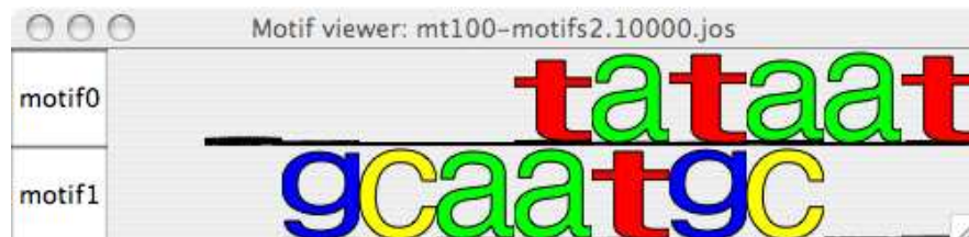
Figure 3: Motifs discovered from the demonstration set.

The sample files contain motif data in a NestedMICA-specific binary format (actually serialized instances of BioJava WeightMatrix objects).