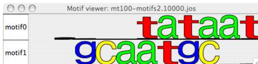
Figure 3: Motifs discovered from the demonstration set.

The sample files contain motif data in a NestedMICA-specific binary format (actually serialized instances of BioJava WeightMatrix objects).