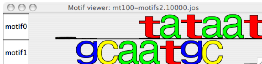
Figure 3: Motifs discovered from the demonstration set.

The sample files contain motif data in a NestedMICA-specific binary format (actually serialized instances of BioJava WeightMatrix objects).