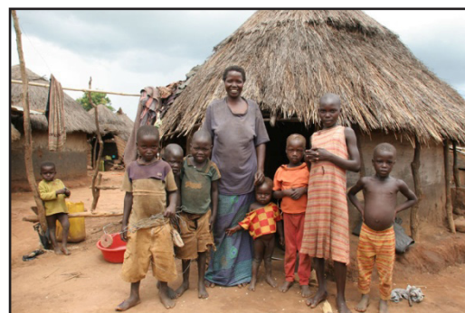
A Ugandan family.