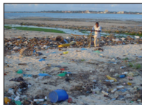
Inadequate waste collection is a major issue in the city.