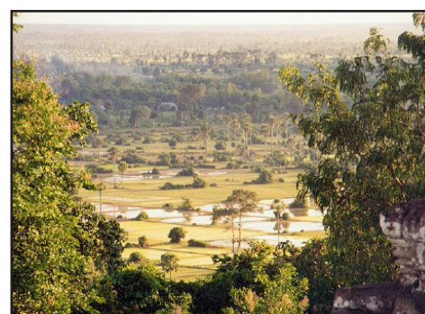
57.6% of Cambodia's population relies on agriculture for their livelihood.